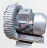
SIDE CHANNEL PUMP