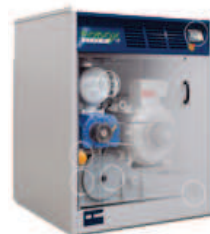
SOUND-PROOF THREE LOBES PUMP