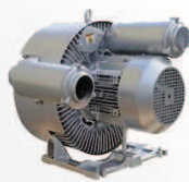
TWO SIDE-CHANNEL PUMP