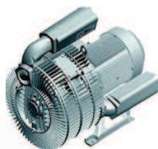
THREE SIDE-CHANNEL PUMP